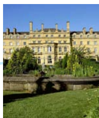
Judging Venue, The Royal York Hotel