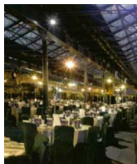
The National Railway Museum, York